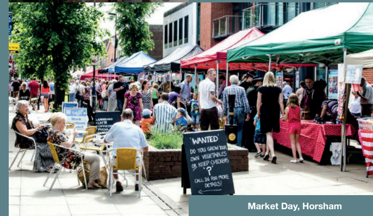
Market Day, Horsham